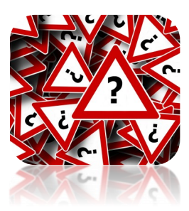
Issues of Nurses in the Hospital